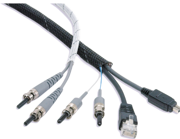
Many telecommunications companies rely on Flexo Halar® for their plenum wiring systems.