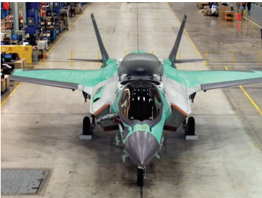
Halar's® low outgassing, as well as its heat, chemical, and radiation properties, make it ideal for use as a component in technologically advanced applications.